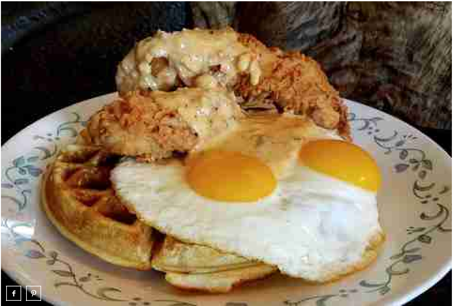
WHISKEY CAKE PLANO