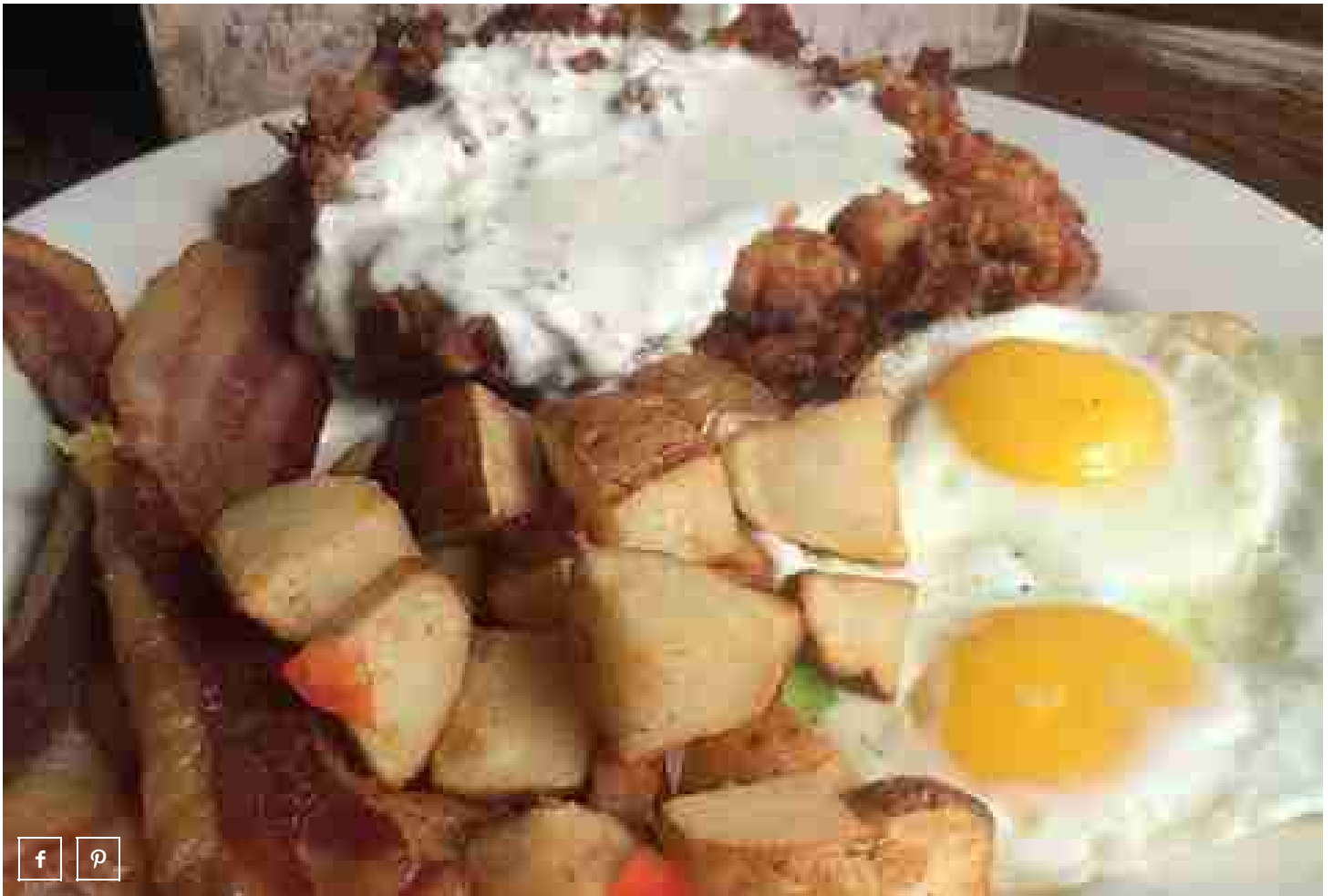
THE LIBERTINE BAR