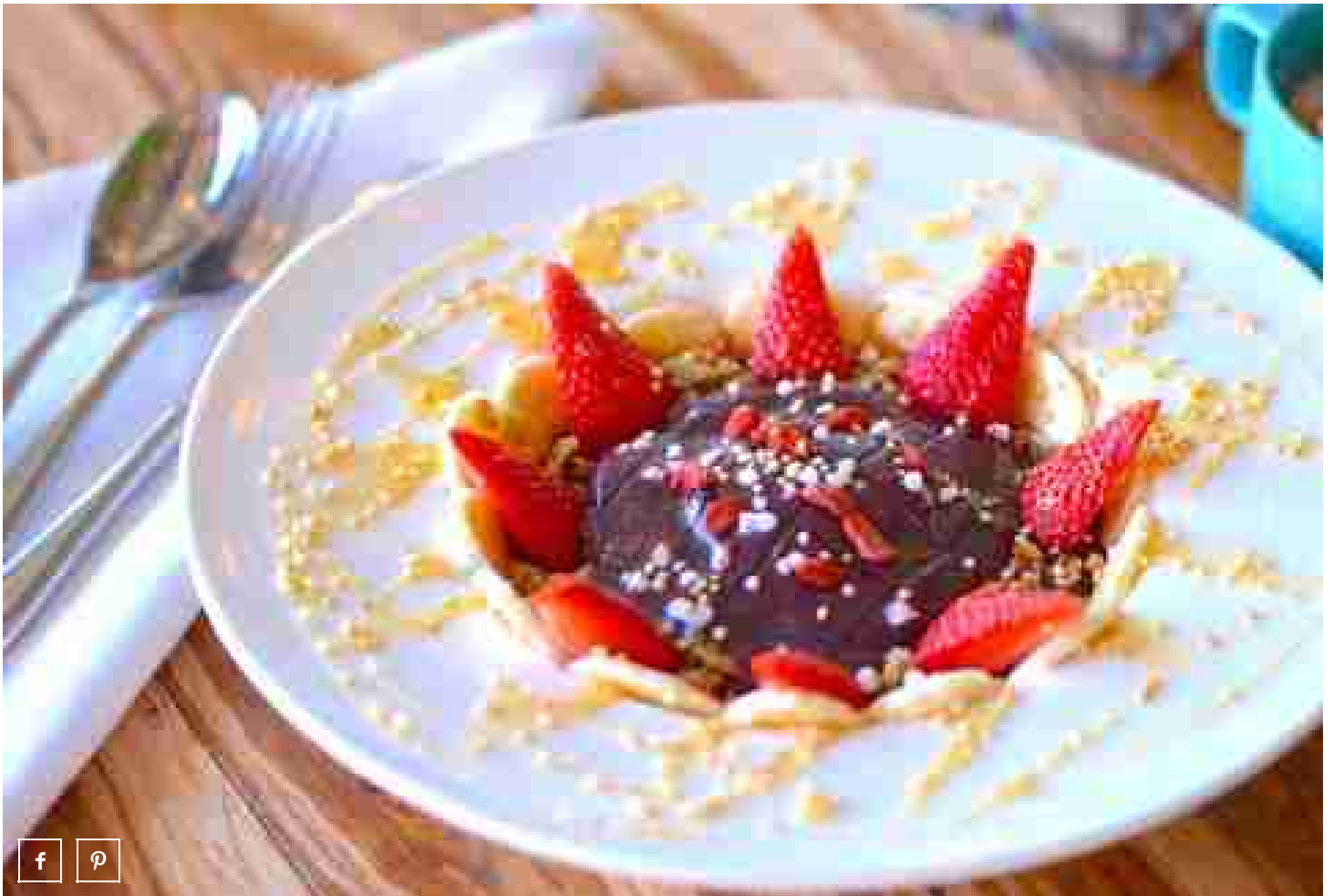
NAZCA KITCHEN - SOUTH AMERICAN CAFE