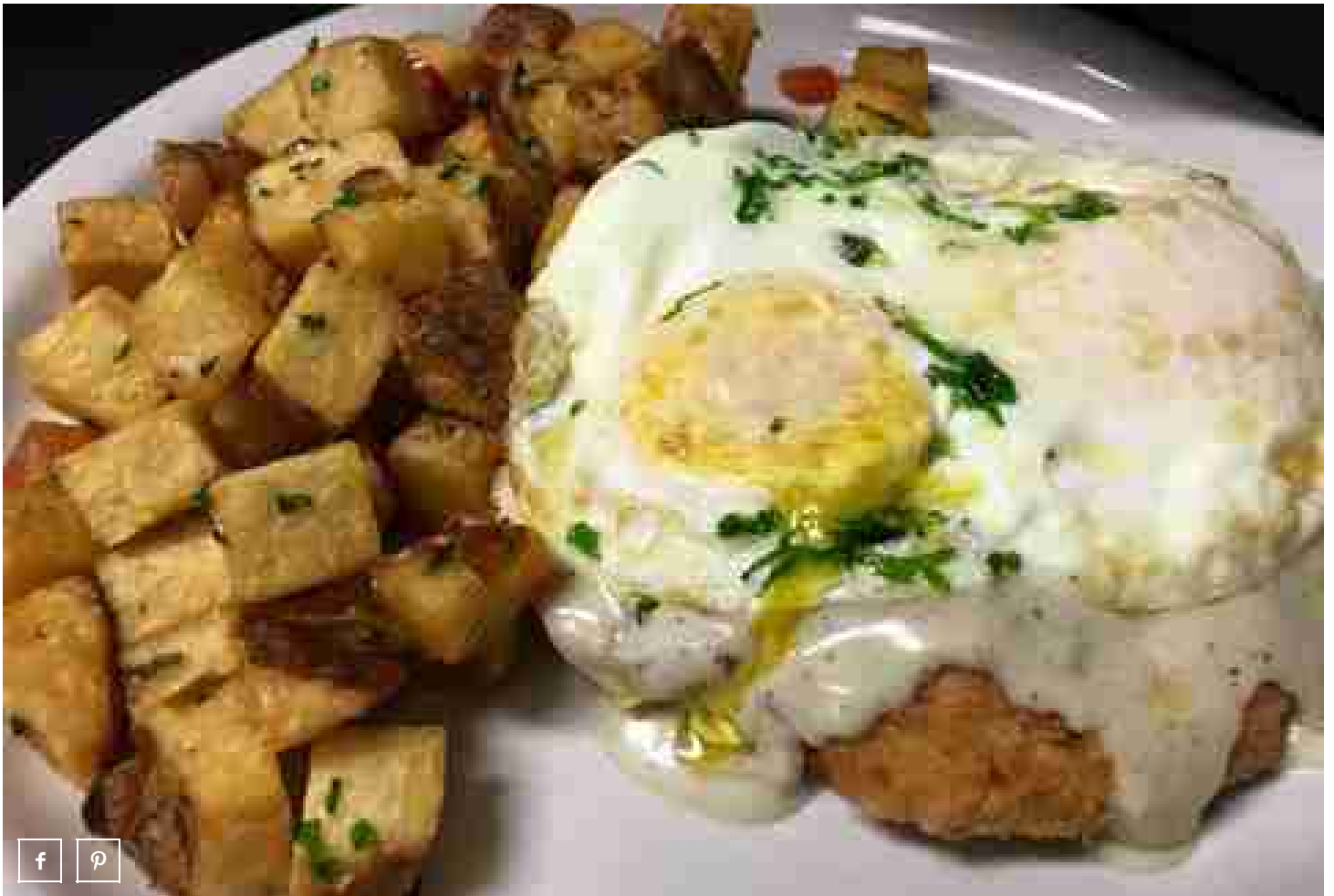
TEN BELLS TAVERN