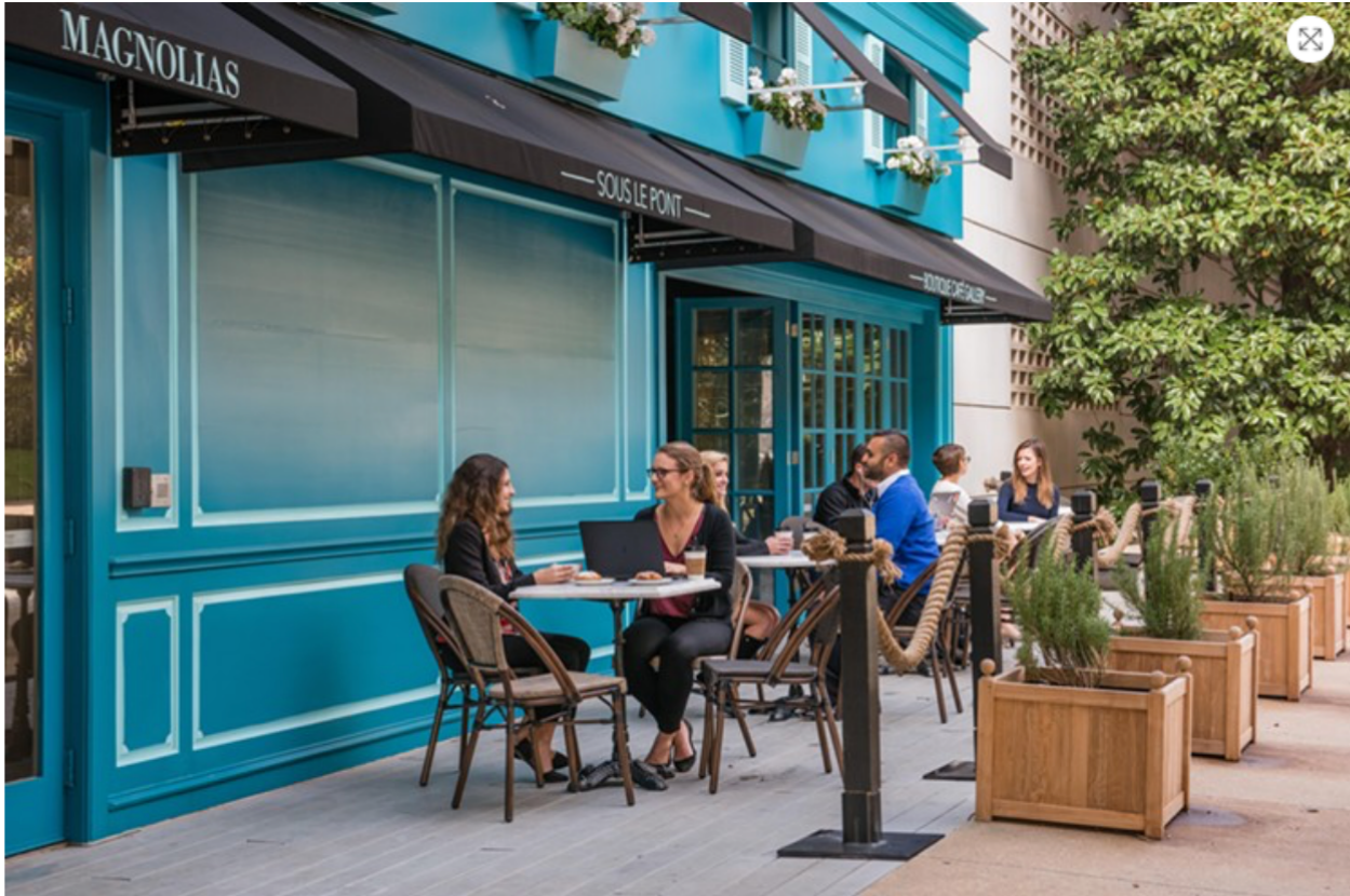
Start the morning off sipping lattés at the oh-so-chic Magnolias Sous Le Pont.