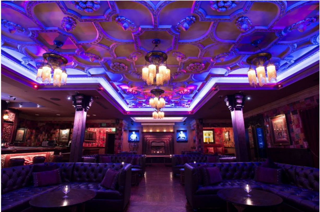
An overall view of the recently renovated Foundation Room is shown Monday, February 29, 2016 in Dallas.