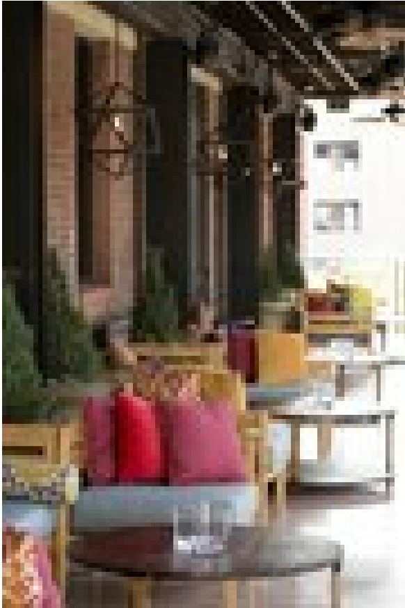
Rosemary bushes and Moroccan-themed pillows decorate the patio of the recently renovated Foundation Room Monday, February 29, 2016 in Dallas.