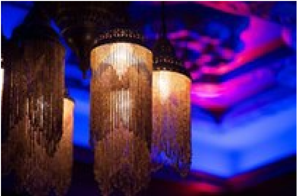
A light fixture showing the Eastern-influenced aesthetic of the recently renovated Foundation Room hangs from the ceiling Monday, February 29, 2016 in Dallas.