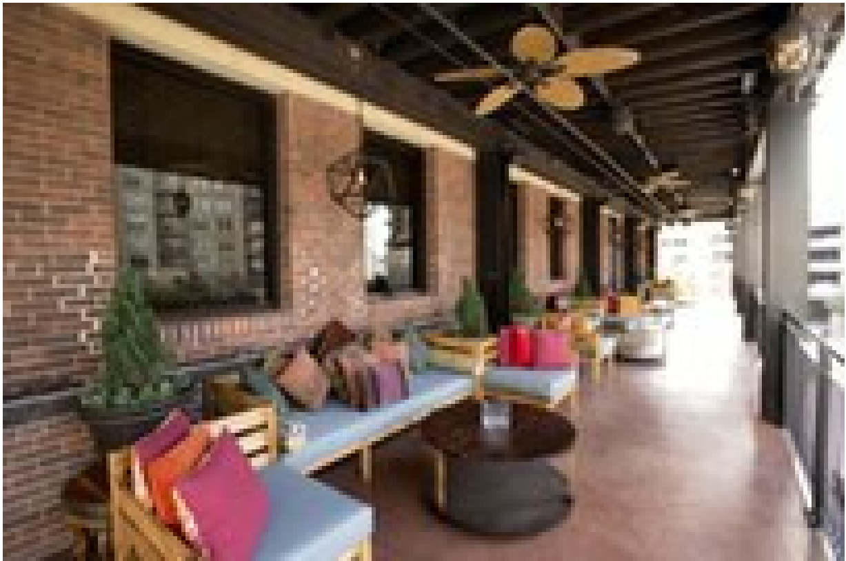
Rosemary bushes and Moroccan-themed pillows decorate the patio of the recently renovated Foundation Room Monday, February 29, 2016 in Dallas.