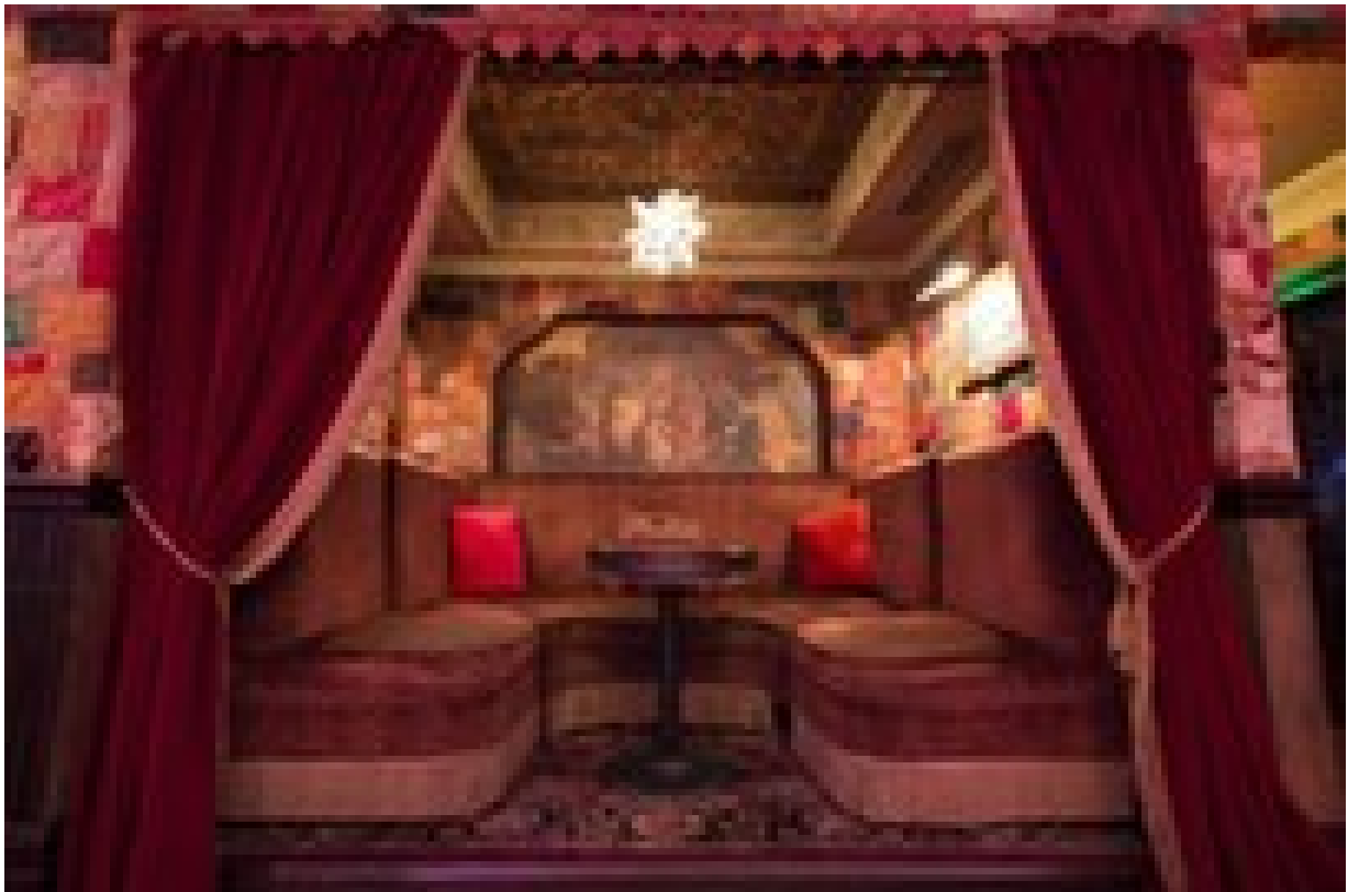
One of several VIP booths in the recently renovated Foundation Room is shown Monday, February 29, 2016 in Dallas.