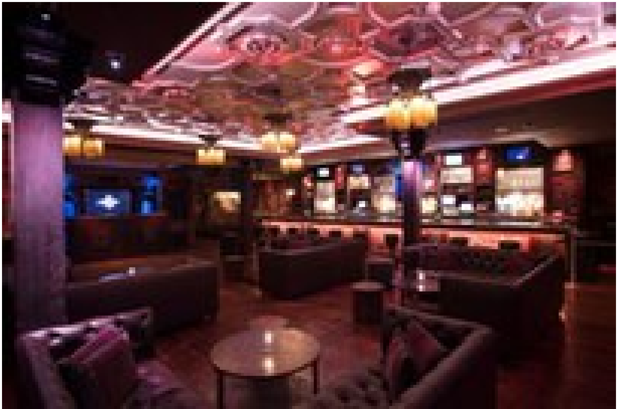
An overall view of the recently renovated Foundation Room is shown Monday, February 29, 2016 in Dallas.