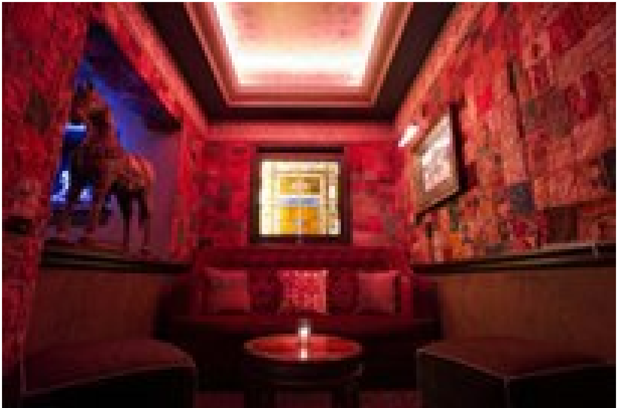
One of several VIP booths in the recently renovated Foundation Room is shown Monday, February 29, 2016 in Dallas.